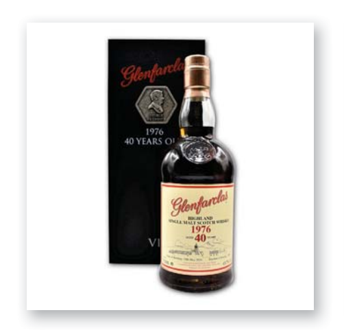
LOT 284 GLENFARCLAS 40 YO