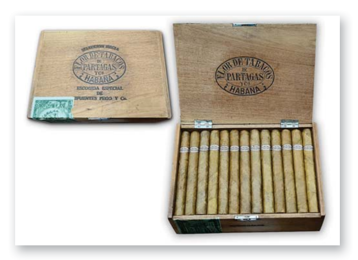
LOT 235 PARTAGAS NACIONALES