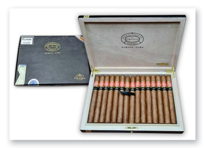
LOT 185 PARTAGAS LUSITANIAS GRAN RESERVA