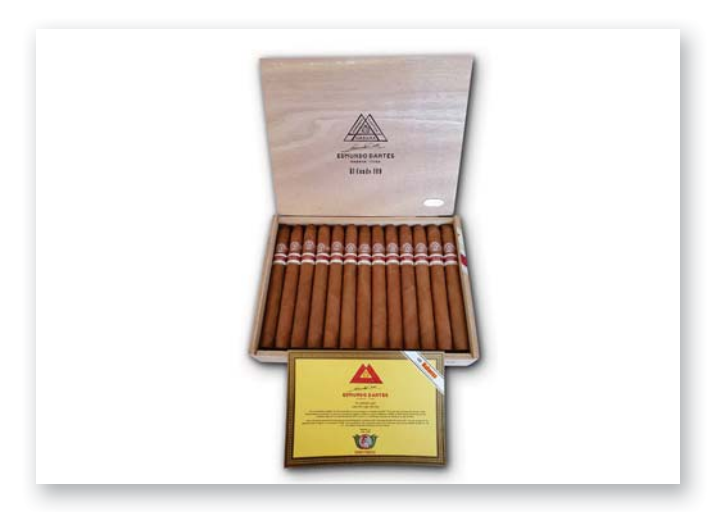
LOT 381 EDMUNDO DANTES EL CONDE 109