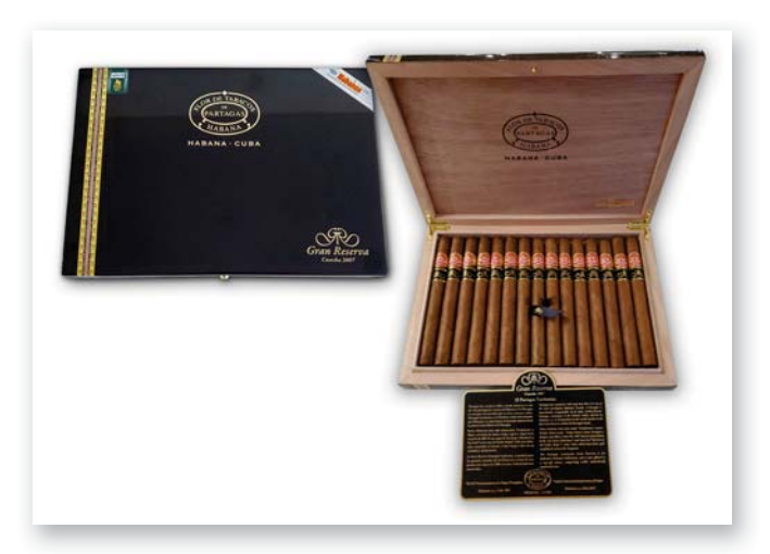
LOT 413 PARTAGAS LUSITANIAS GRAN RESERVA