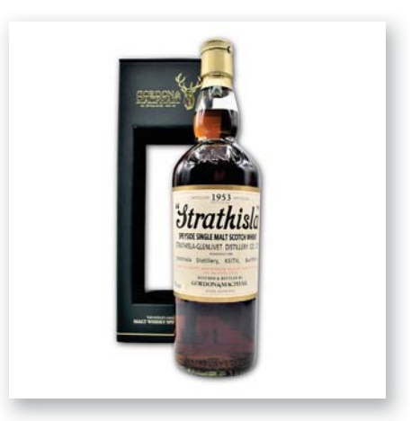
LOT 337 STRATHISLA GORDON & MACPHAIL 1953 - BOTTLED 2012