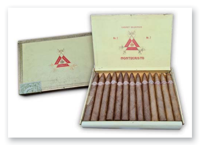
LOT 30 MONTECRISTO No.2