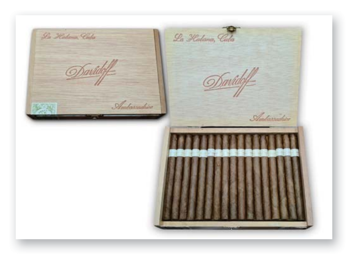
LOT 198 DAVIDOFF AMBASSADRICE