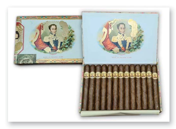
LOT 221 BOLIVAR CORONAS EXTRA