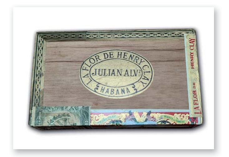
LOT 230 HENRY CLAY NON PLUS ULTRA COQUETAS