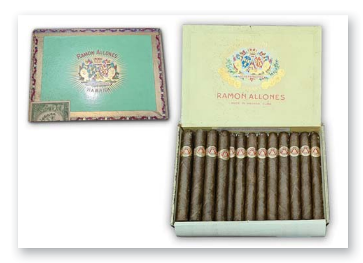
LOT 241 RAMON ALLONES CORONAS