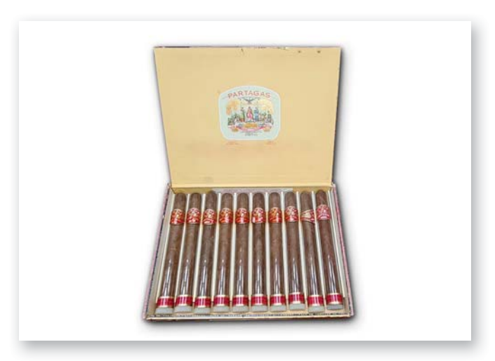
LOT 236 PARTAGAS VISIBLE