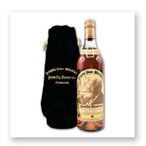
LOT 326 PAPPY VAN WINKLE'S 23 YO