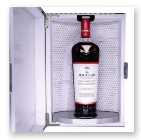
LOT 311 MACALLAN DISTIL YOUR WORLD LONDON