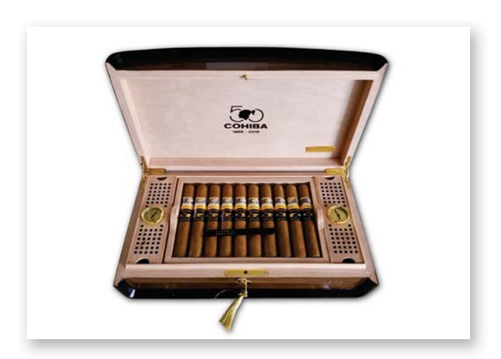
LOT 216 COHIBA 1966 MAJESTUOSOS