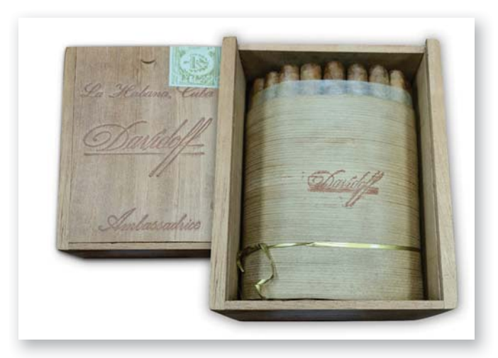
LOT 197 DAVIDOFF AMBASSADRICE