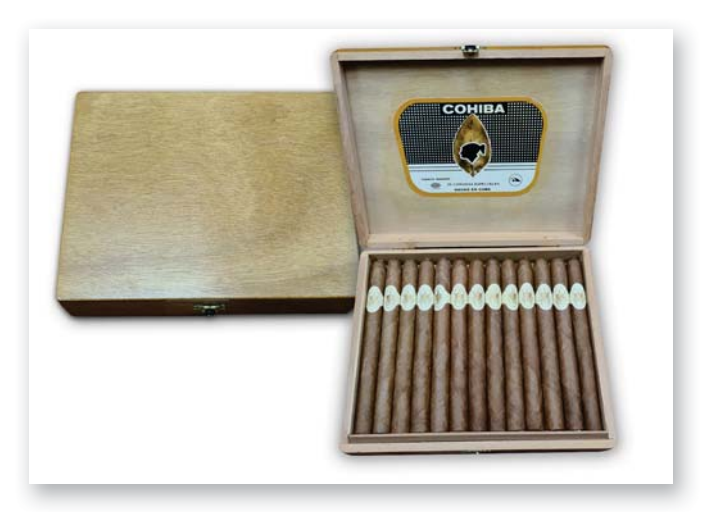
LOT 12 COHIBA CORONAS ESPECIALES PRESIDENCIA