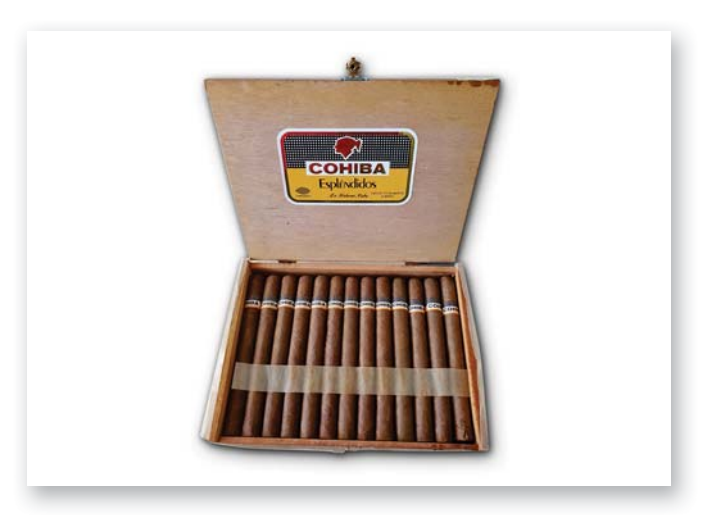
LOT 357 COHIBA ESPLENDIDOS