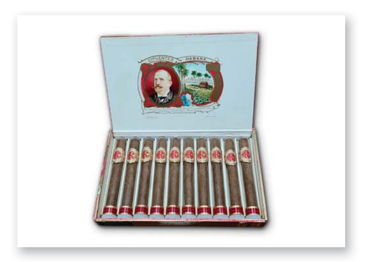
LOT 223 CIFUENTES CRISTALTUBO