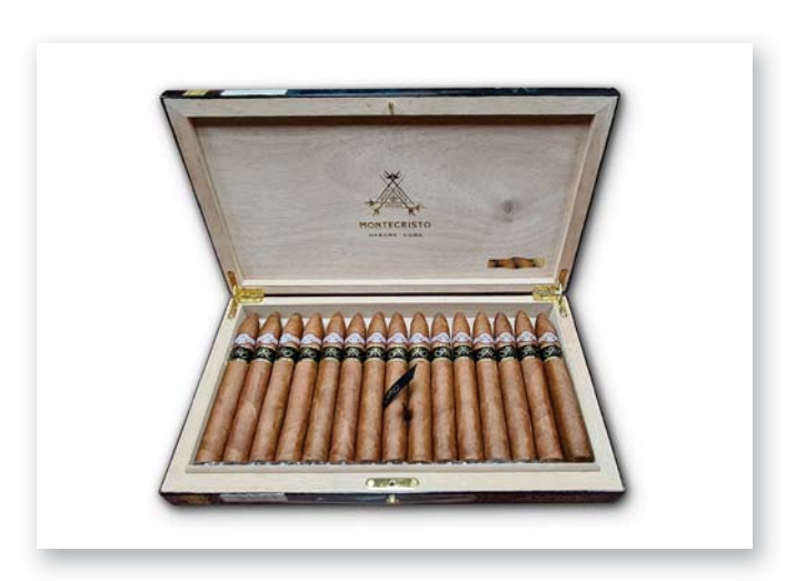
LOT 183 Montecristo No.2 Gran Reserva