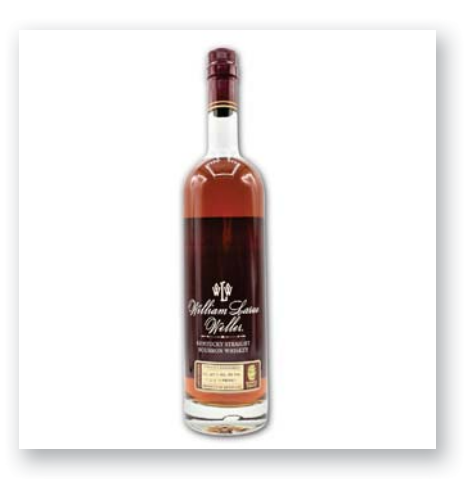
LOT 348 WILLIAM LARUE WELLER BTAC 2018 RELEASE