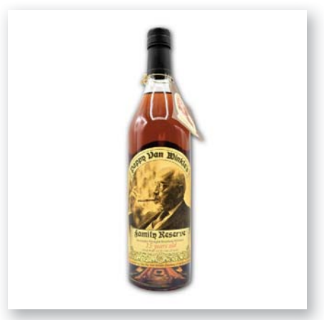
LOT 325 PAPPY VAN WINKLE'S 15 YO