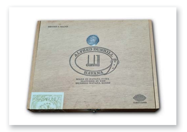
LOT 206 DUNHILL ESTUPENDOS