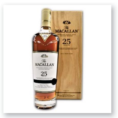
LOT 310 MACALLAN 25 YO