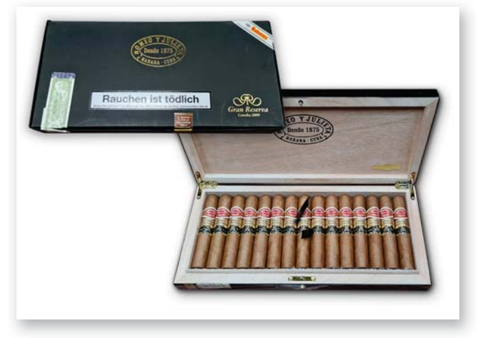
LOT 188 ROMEO Y JULIETA WIDE CHURCHILLS GRAN RESERVA