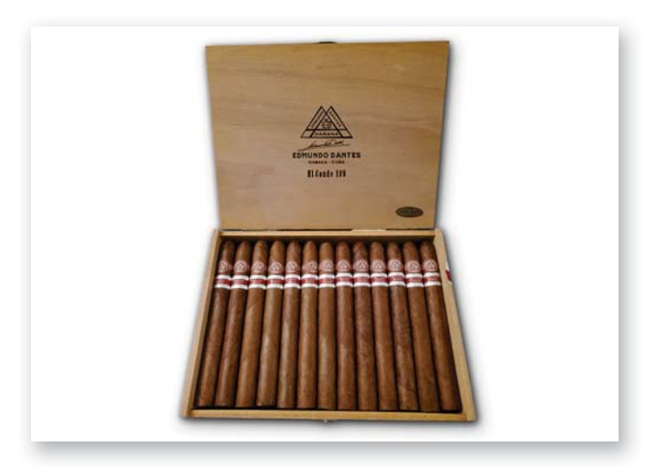
LOT 396 EDMUNDO DANTES EL CONDE 109