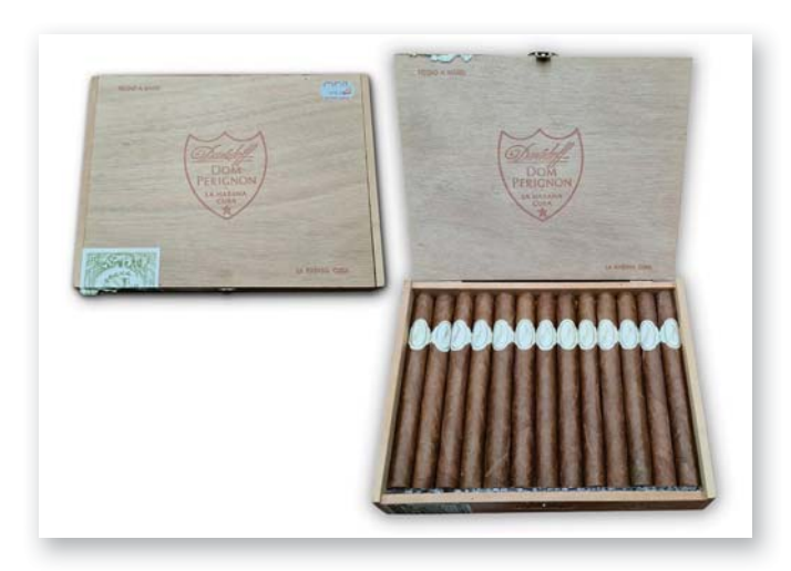
LOT 203 DAVIDOFF DOM PERIGNON