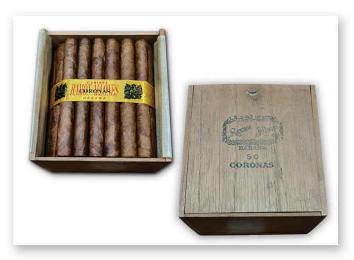
LOT 238 RAMON ALLONES CORONAS