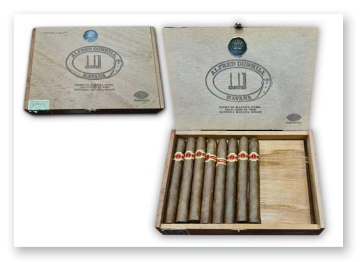
LOT 211 DUNHILL MOJITO