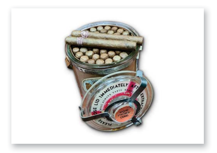
LOT 2 H.UPMANN CRYSTALES