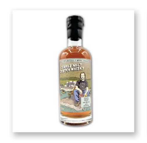
LOT 329 PORT ELLEN 33 YO