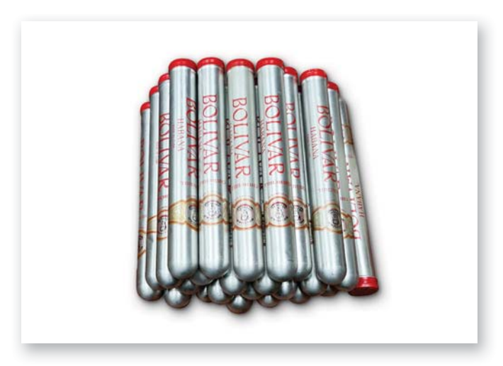
LOT 8 BOLIVAR CHURCHILLS TUBED