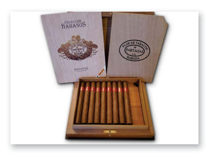
LOT 418 PARTAGAS SERIE C No.1