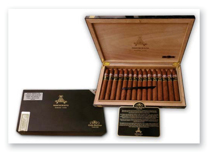
LOT 412 MONTECRISTO No.2 GRAN RESERVA