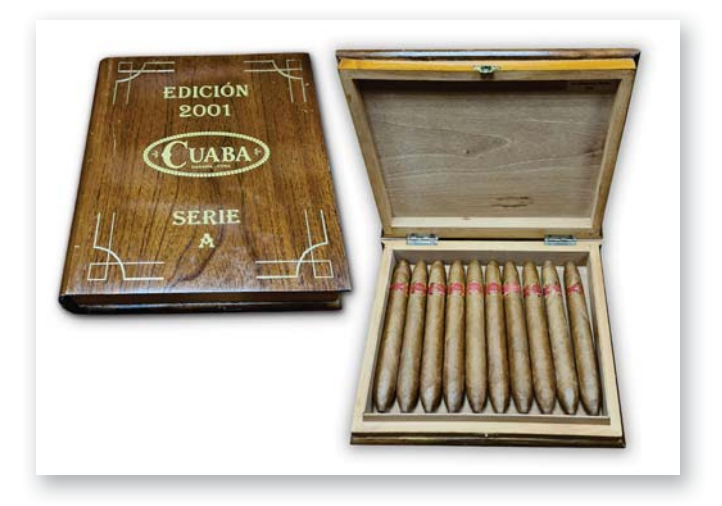
LOT 190 CUABA SERIE A