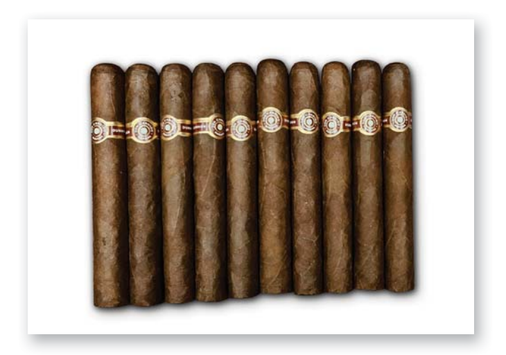
LOT 208 DUNHILL DON CANDIDO SELECCION NO.506