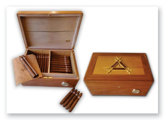
LOT 426 MONTECRISTO HUMIDOR