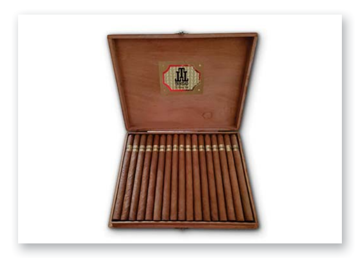
LOT 395 TRINIDAD DIPLOMATIC