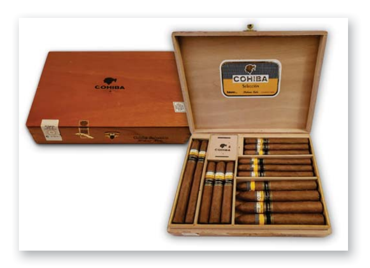
LOT 409 COHIBA SELECCION RESERVA