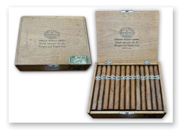
LOT 246 ROMEO Y JULIETA ROMEO LARGAS