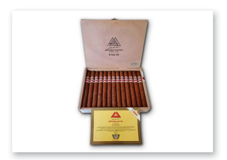
LOT 397 EDMUNDO DANTES EL CONDE 109