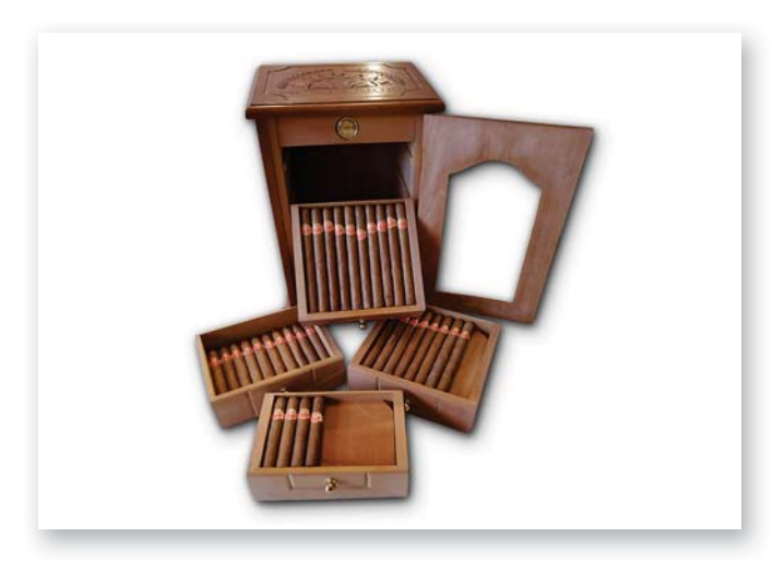
LOT 425 H.UPMANN 160TH ANNIVERSARY HUMIDOR