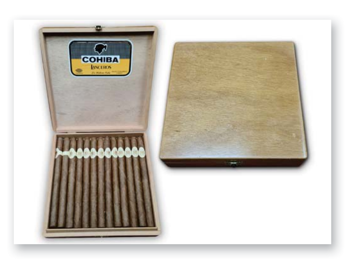
LOT 13 COHIBA LANCEROS PRESIDENCIA