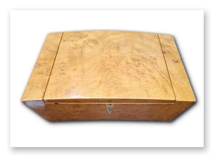
LOT 215 HABANOS 1994