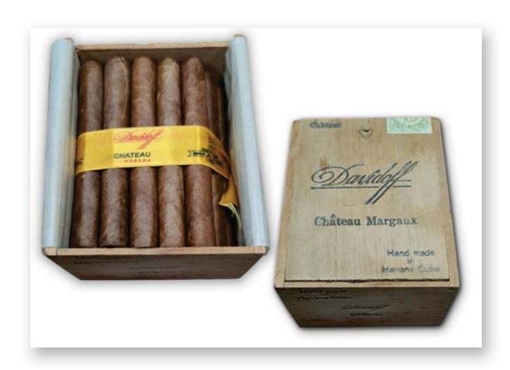
LOT 200 DAVIDOFF CHATEAU MARGAUX