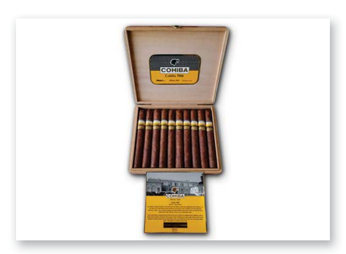
LOT 378 COHIBA 1966