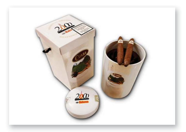
LOT 353 DUNHILL MALECON