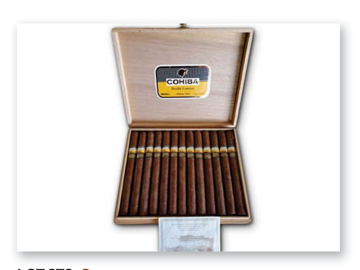
LOT 379 COHIBA DOUBLE CORONAS