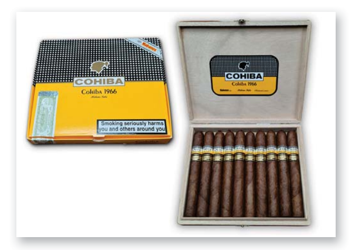
LOT 110 COHIBA 1966