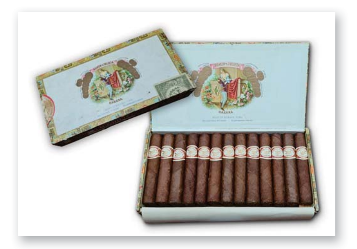
LOT 49 ROMEO Y JULIETA GIRALDAS No.4