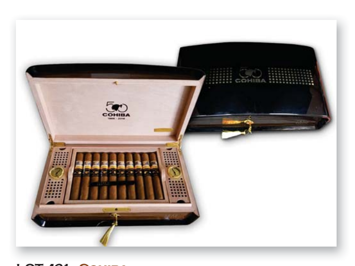
LOT 421 COHIBA 1966 MAJESTUOSOS