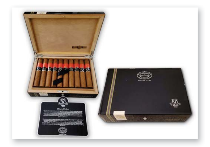
LOT 415 PARTAGAS SERIE D No.4 RESERVA