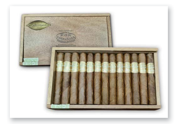
LOT 41 POR LARRANAGA SMALL CORONAS