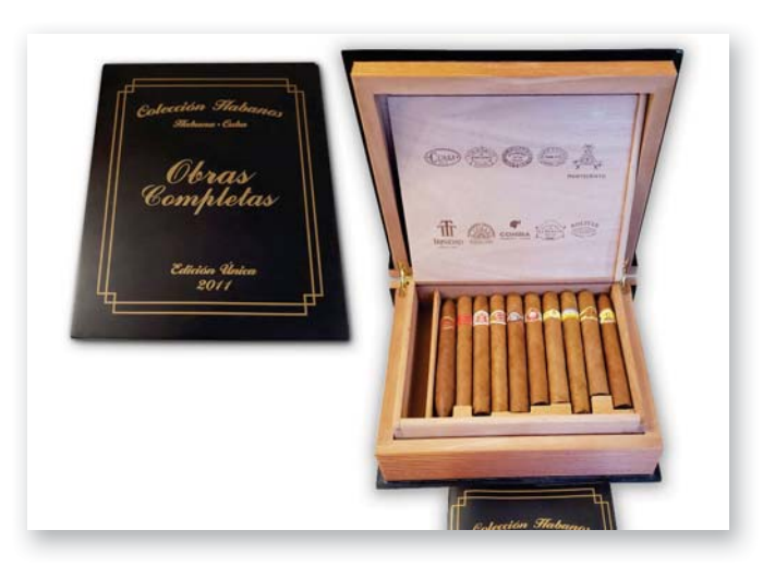
LOT 417 PARTAGAS OBRAS COMPLETAS