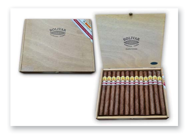
LOT 165 BOLIVAR DOUBLE CORONAS