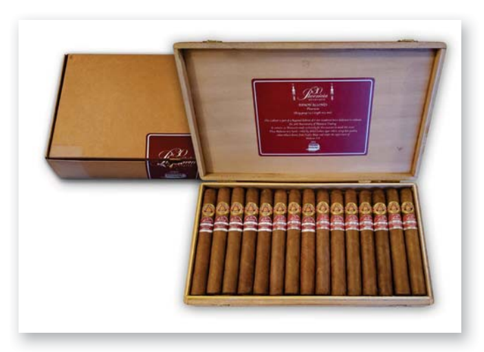
LOT 407 RAMON ALLONES PHOENICIOS